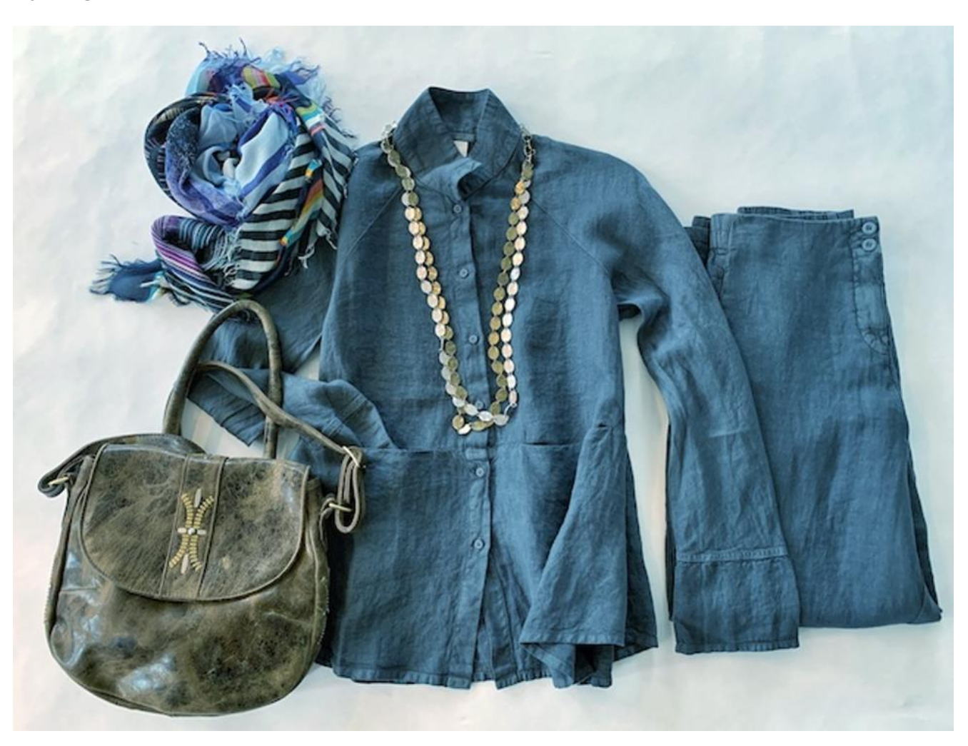
Some take-along suggestions Marsha L. Miranda

By the way, Katharina Hoffman also makes a perfect shirt for travel. It can be worn with jeans or to a black-tie event. It is lightweight, packable, can be rinsed out, and air dries in no time. Finally, another travel essential is a light and very soft sweater that can be used either layering or worn as a scarf.