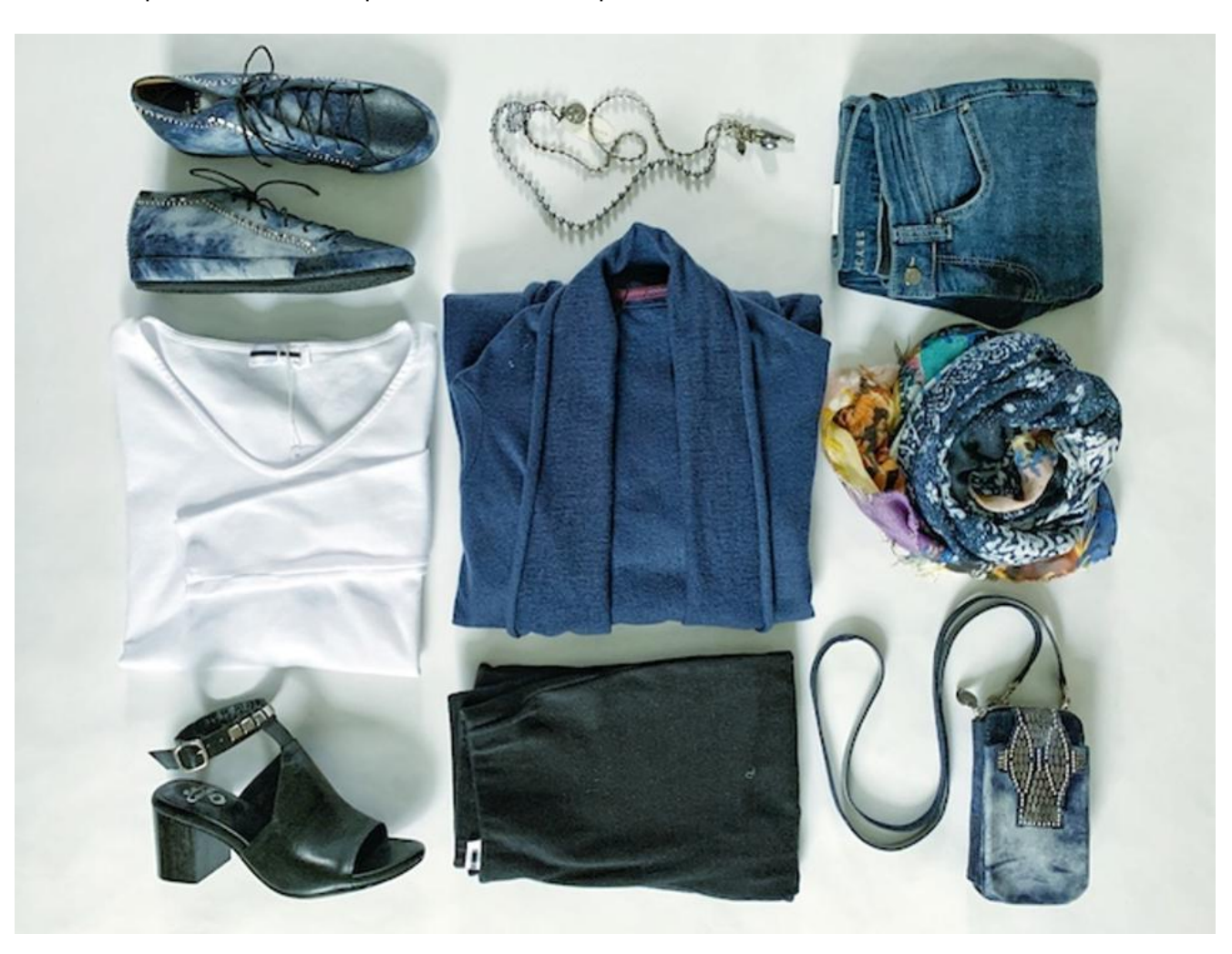
Easy to wear and easy to pack Marsha L. Miranda

Another jacket by the same designer that's a great choice for a long-haul flight, when the cabin temperature can drop, is shown in the photo below.