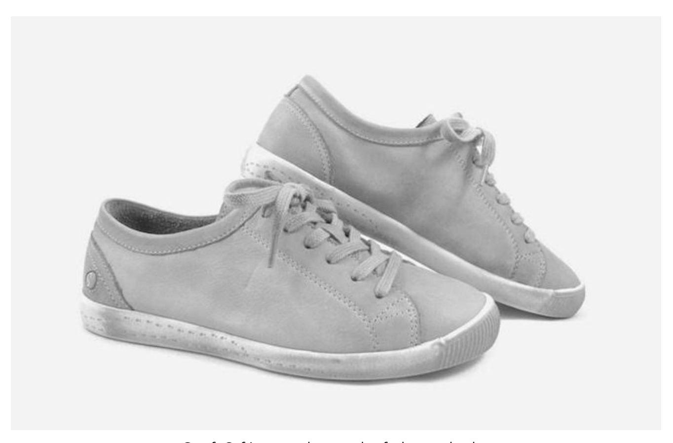
Comfy Softinos sneakers made of a buttery leather Softinos

A pair of leather <u>Softinos</u> sneakers are great, too! Made in Portugal, the buttery soft leather makes them feel like slippers. The rubber soles are flexible, ensuring comfort at the airport or at your destination.